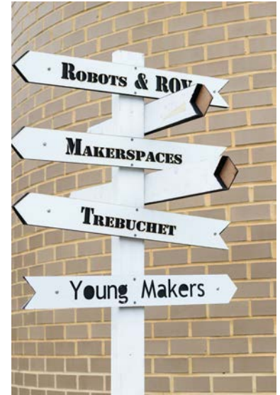
Some NoVa Mini Maker Faire Neighborhoods